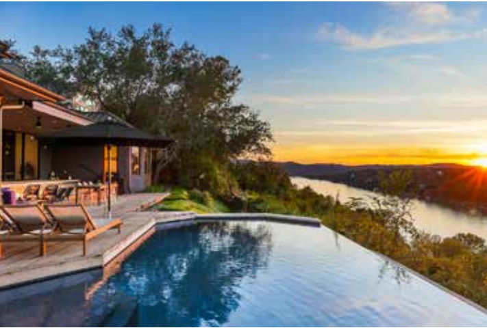
4104 Aqua Verde | Westlake Listed for $6,695,000