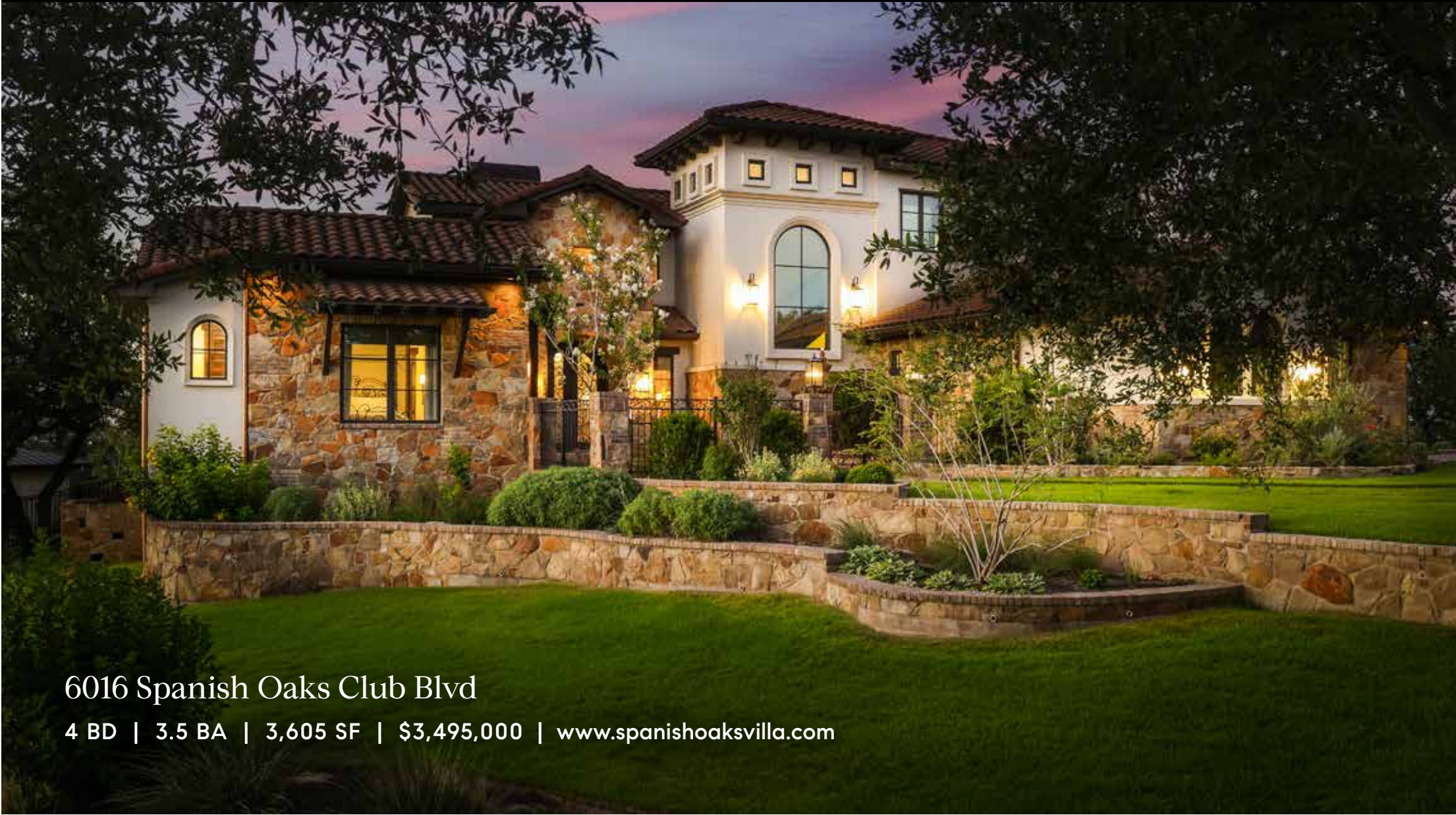
6016 Spanish Oaks Club Blvd 4 BD | 3.5 BA | 3,605 SF | $3,495,000 | www.spanishoaksvilla.com