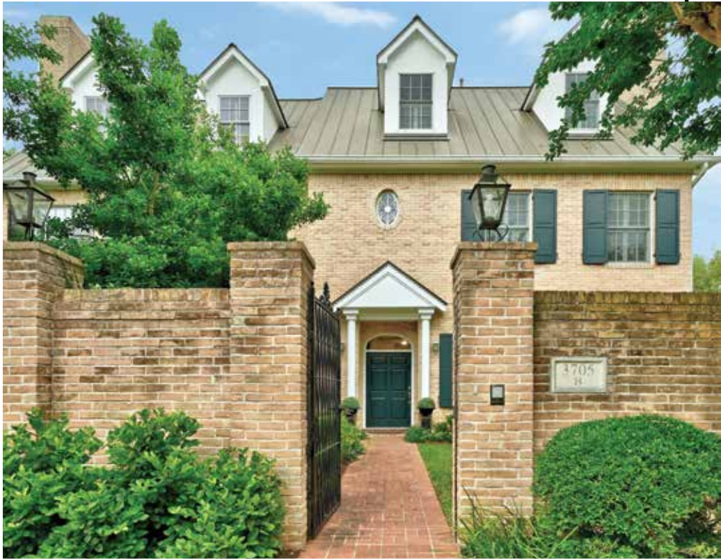
3705GILBERTSTREET.COM | 5 BR | 5F+2H BA | Elevator | 2-Car Garage Offered for $3,750,000