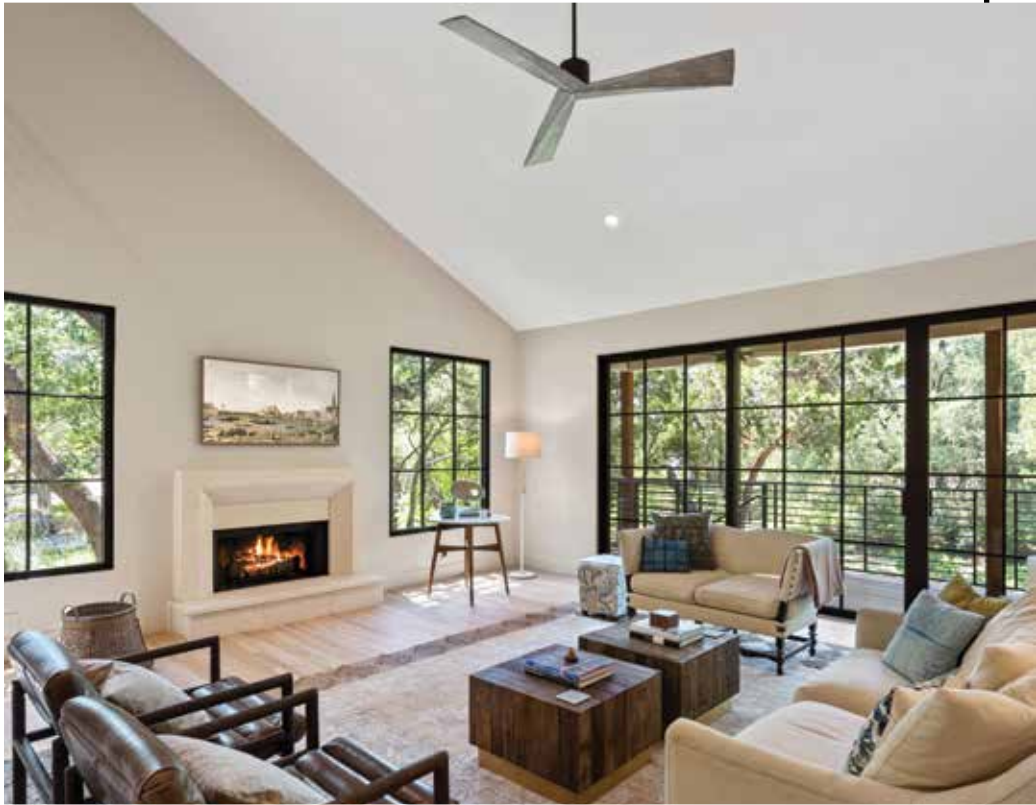
417LEDGEWAY.COM | 5 BR | 5.5 BA | 4.7 Acres | Fully Remodeled Offered for $7,800,000