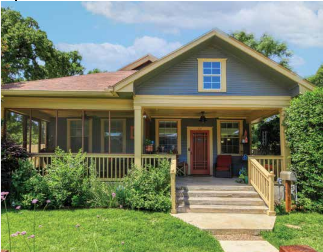
613WEST33RDSTREET.COM | 3 BR | 2 BA | Pool | Central Austin Offered for $1,489,000