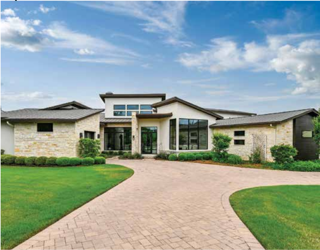
3612VERANODRIVE.COM | 5 BR | 5F+3H BA | 3-Car Garage | Pool | Gated Offered for $4,445,000

4th Generation Austinite helping clients with real estate moves into town, out of town or across town