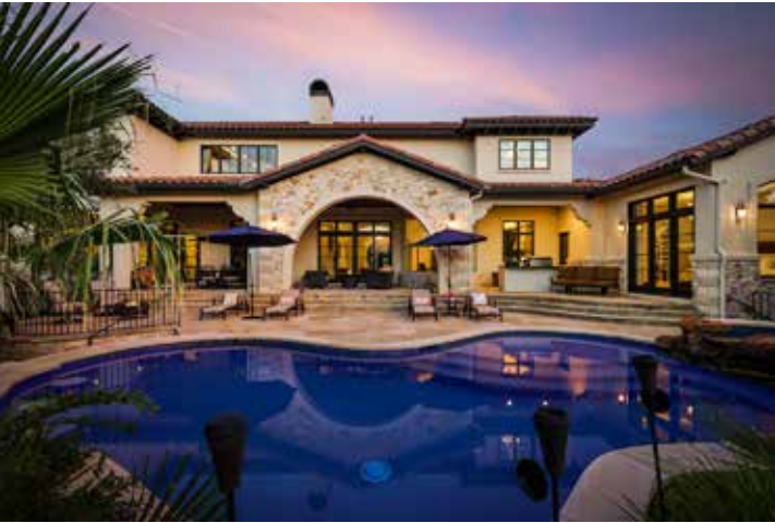
9120 Brookhurst Cv | Seven Oaks Listed for $4,500,000