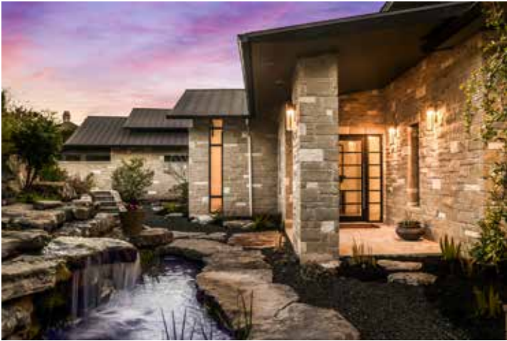
Verano | Barton Creek Price Upon Request