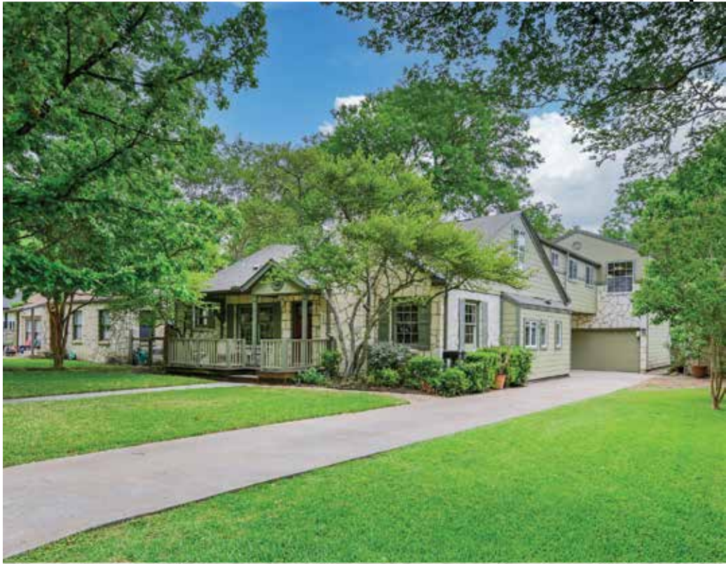
2407SHARONLANE.COM | 4 BR | 2 BA | 1 BR/1 BA Apartment | 2-Car Garage Offered for $1,980,000