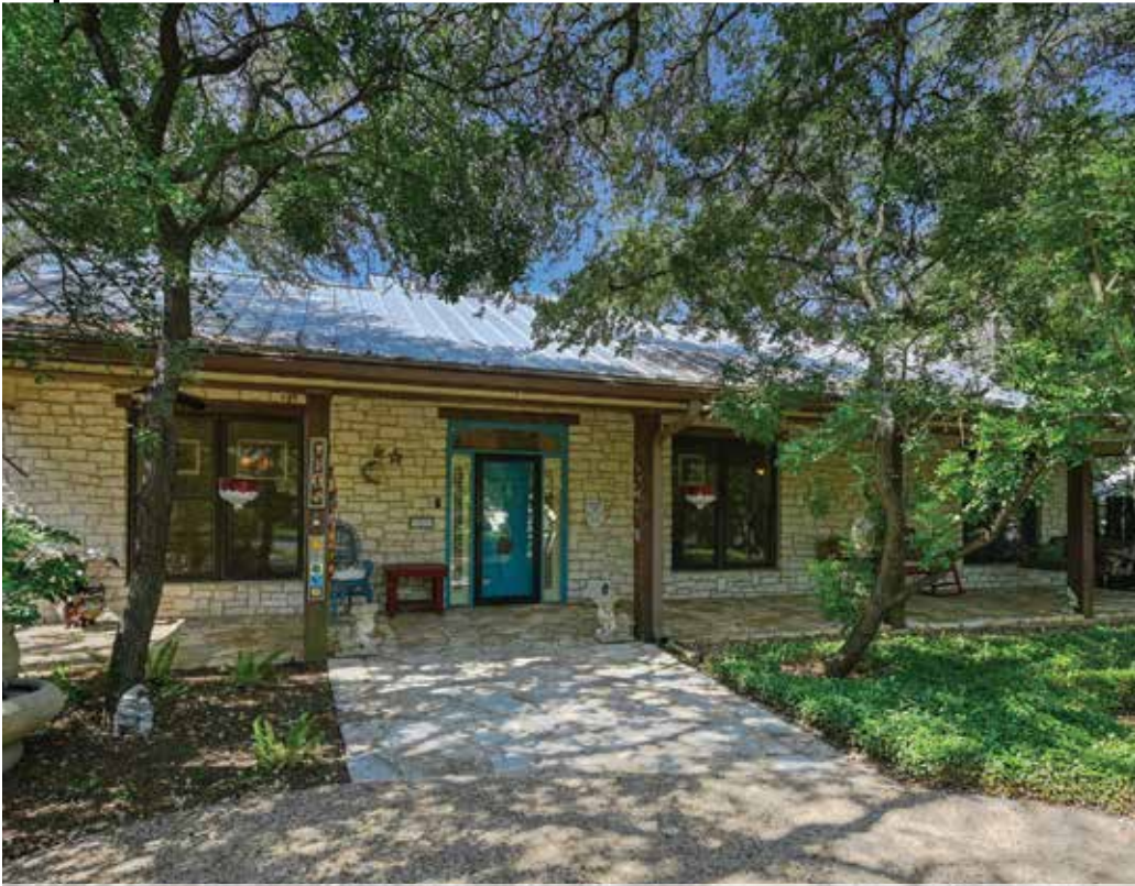
6615LACONCHAPASS.COM | 5 BR | 5 BA | .9 Acre | 2-Car Garage Offered for $1,650,000