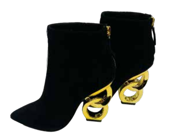
KAT MACONIE CHAIN BOOT

Need Help Finding the Perfect Gift this Holiday Season?