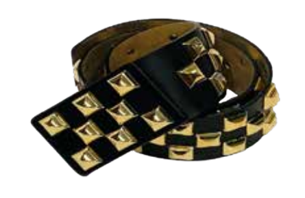
STREETS AHEAD STUDDED BELT