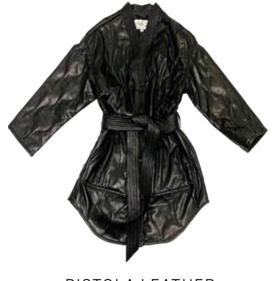
PISTOLA LEATHER KIMONO JACKET