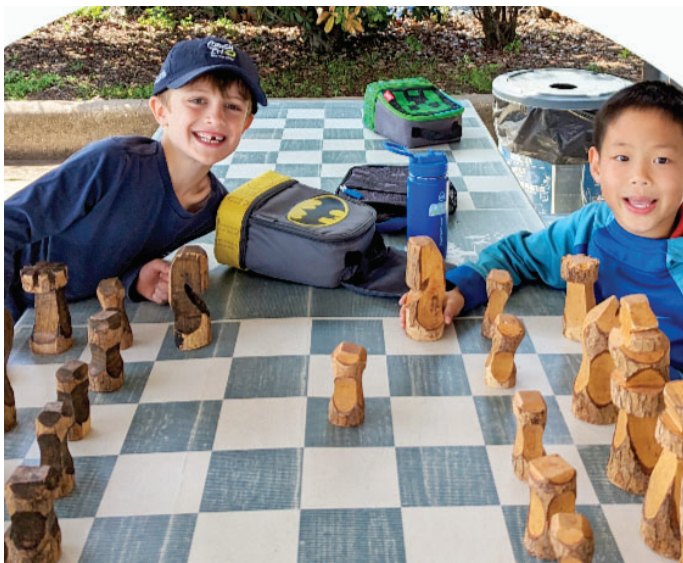
First Tee-Greater Austin summer camp

Experienced coaches not only provide an introduction to junior golf and an