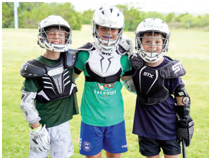
LAX Camp is a fun, high-energy camp to help your child build skills and confidence on the field.

Creative students can step into the spotlight in Theater Camps for Grades 5-8, developing acting and performance skills while collaborating with fellow campers. Budding musicians can plug in for Rock Band 101, learning the fundamentals of playing together as a band. Future engineers and innovators in Grades 3-8 can explore Robotics Camp, tack-