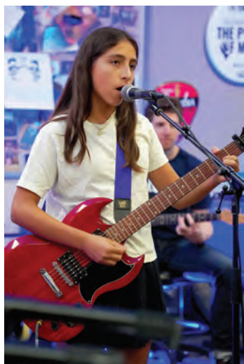
No experience needed! By week's end, Band 101 campers will take the stage for a live band performance.

Learn more and register at smcprep.org .