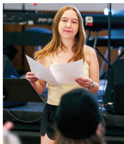
Sharing creative work is a plus at Badgerdog camps