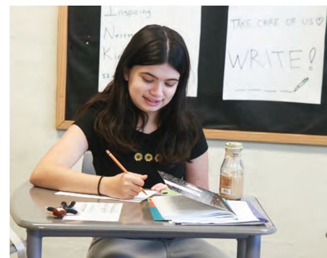
Choose from Badgerdog classes at several Austin school campuses in June and July