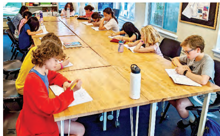
Camps are intimately sized and led by Austin's professional writers

Hosting campuses include Meridian School, Griffin School, Parkside Community School, Austin International School, and Trinity Episcopal School.