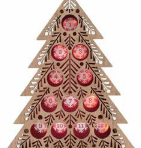
DEMDACO COFFEE POD