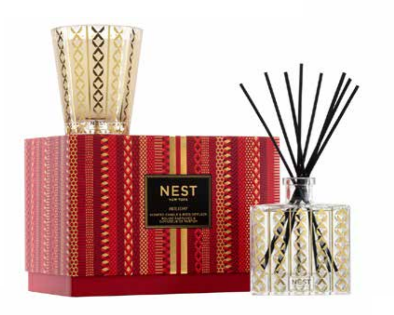
NEST HOLIDAY FRAGRANCE COLLECTION