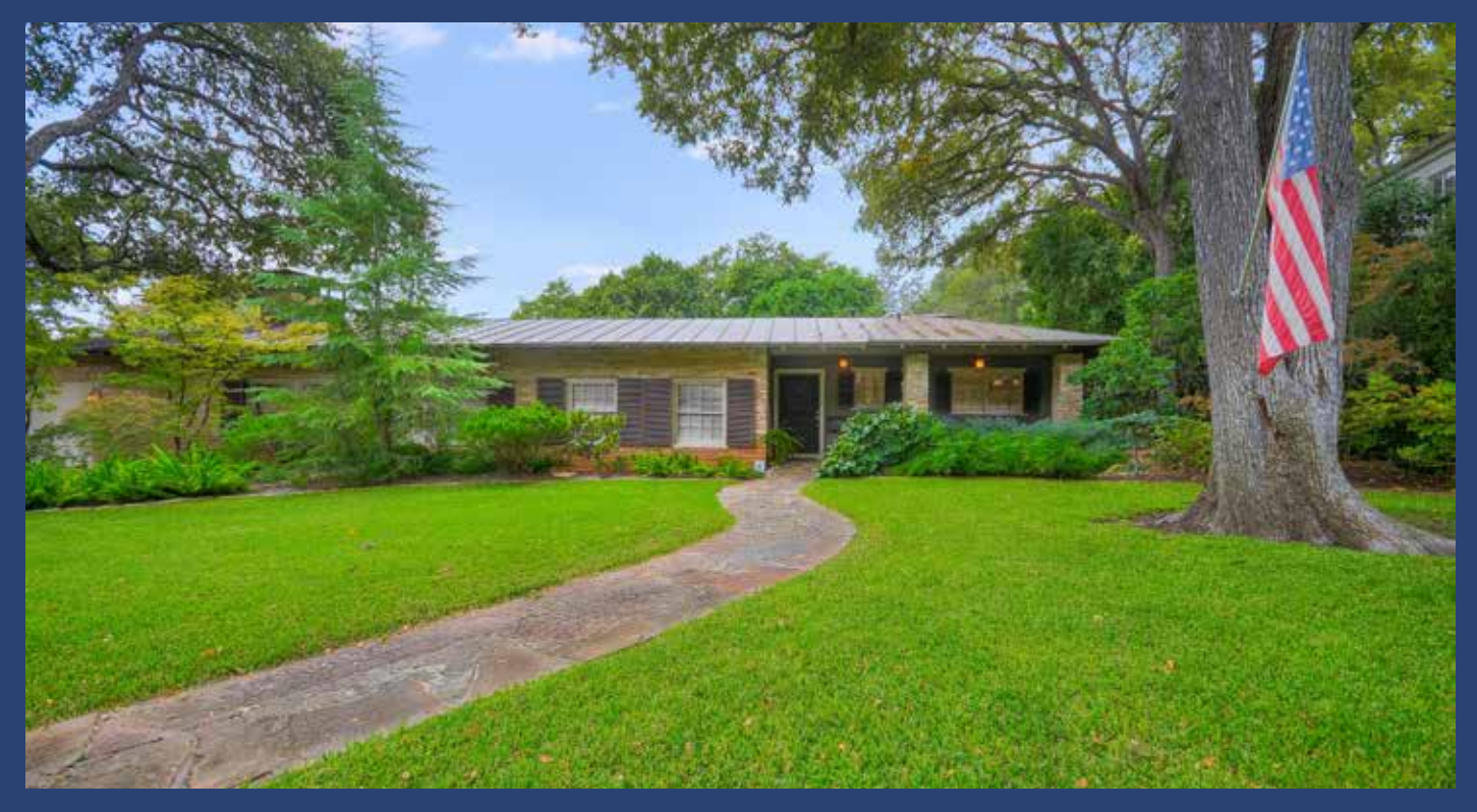
Tarrytown One-Story on Double Lot with 4-Car Garage 1904 Hill Oaks Court 1904HillOaks.com