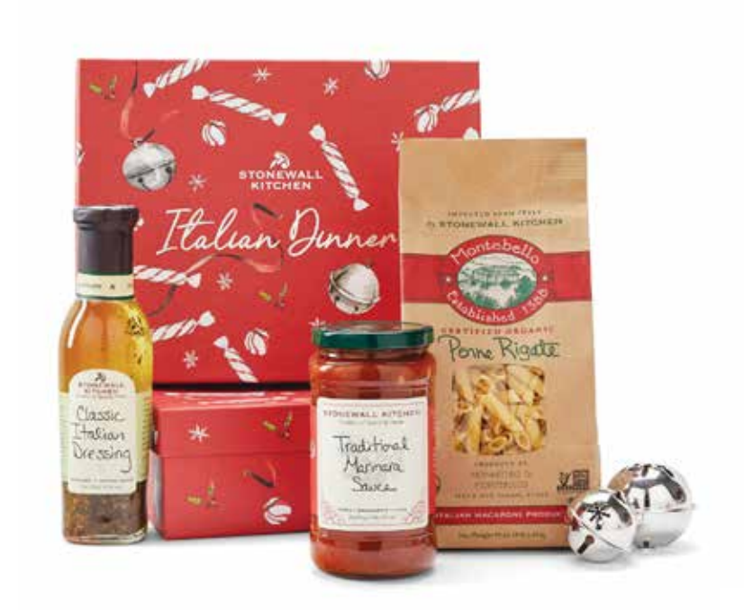
STONEWALL KITCHEN HOLIDAY PASTA GIFT SET (YUMMO)