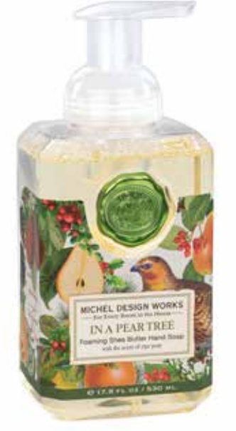
MICHEL DESIGN WORKS IN A PEAR TREE FOAMING SOAP