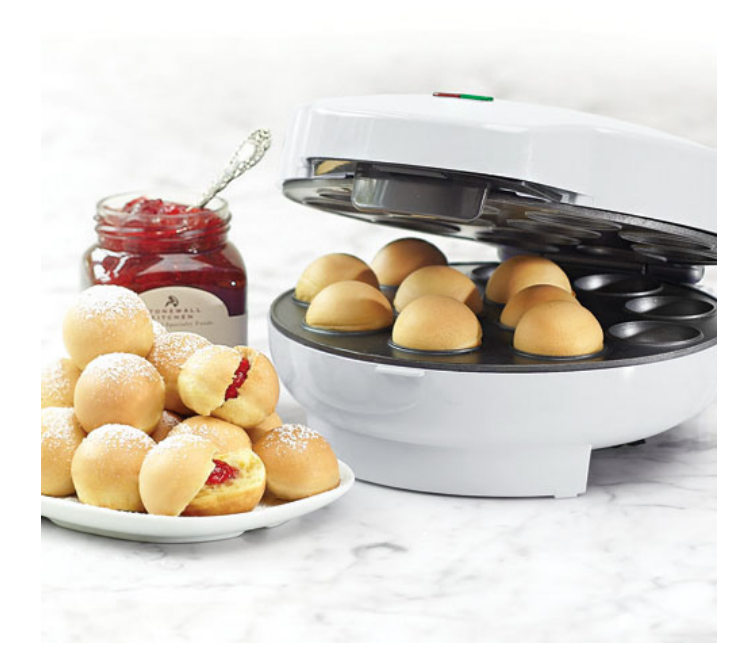
STONEWALL KITCHEN PANCAKE PUFFER BALL MAKER