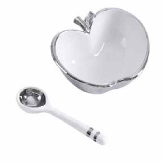
PAMPA BAY APPLE CONDIMENT SET